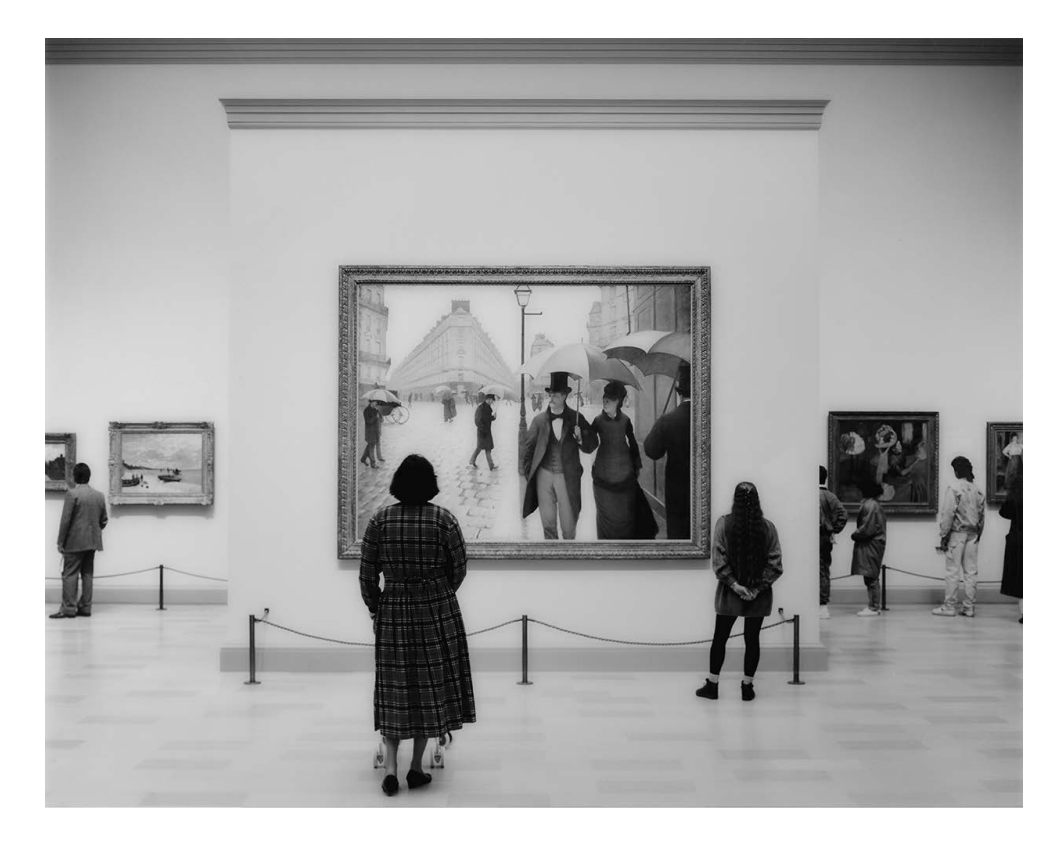
Figure 11.4 Thomas Struth, Art Institute of Chicago II , 1990 (The Art Institute of Chicago)

between right and left is also, by its very nature, an experience of oneself as a subjective center, a fact reflected in Friedrich's commitment to the central axis—to uprightness—in picture after picture. One might think of that centeredness and uprightness as a kind of universality but not the universality of what the world might be imagined to look like if cognition were not grounded in subjective feeling as Kant suggests (that is, if it were wholly objective, without reference to the experiencing subject); by the same token, the subjectivity in question is not mere subjectivity, a kind of unanchored and essentially formless responsiveness to visual or say sensuous stimulus in all their multifariousness and profusion.