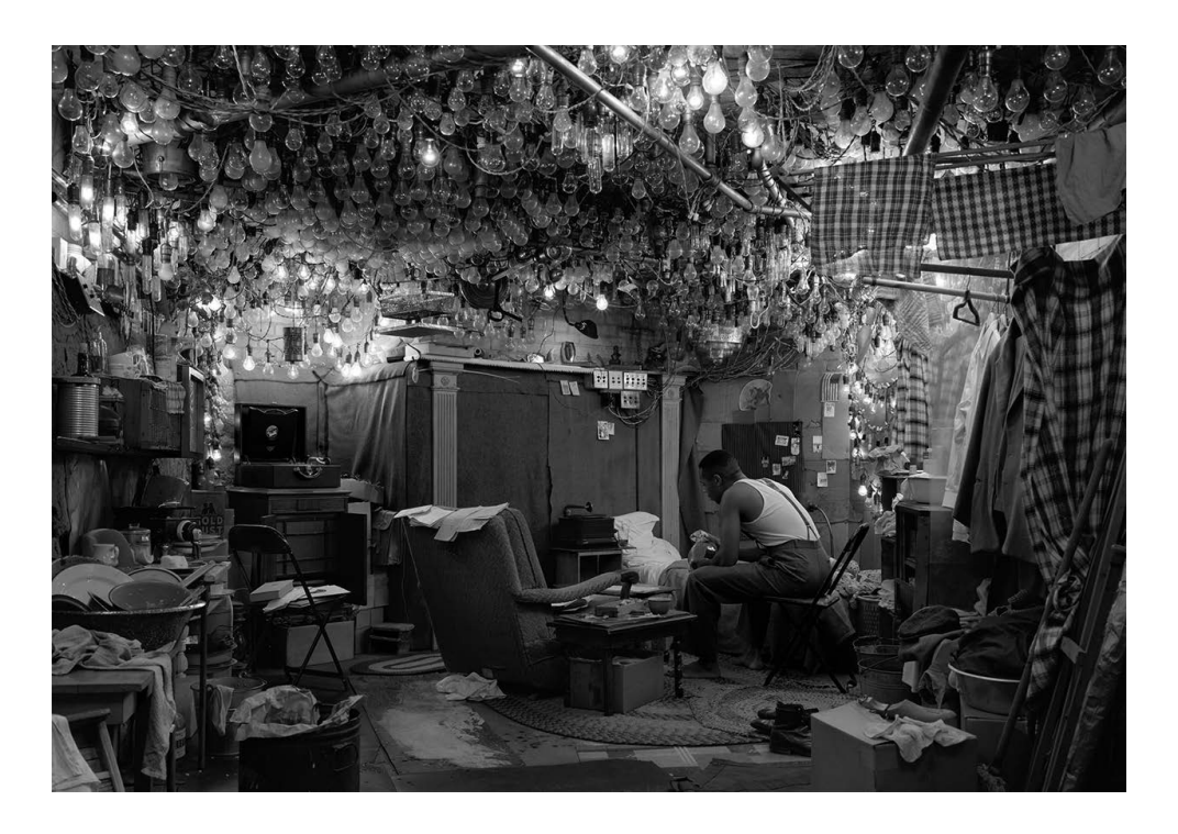
Figure 11.2 Jeff Wall, After "Invisible Man" by Ralph Ellison, the Prologue , 1999–2001 (The Museum of Modern Art, New York City, transparency in lightbox 174 × 250.5cm; image courtesy of the artist)

Fried helps us see with clarity the connection between an artwork's han-dling of being-seen and its ontological force in the work of the contem-porary photographer Jeff Wall. The extensive labor of construction and staging that Wall's near-documentary photographs entail, Fried claims, actually makes it possible for Wall to realize compelling depictions of human beings unaware of being seen or pictured. As Fried suggests, the staggering preparations Wall undertakes in his works underline that in the contexts and environments that interest this photographer, the infer-ence that a human being might be conscious of being beheld can "con-taminate" (WPM 35) a world. Yet Fried reminds us of the distance between the images in Wall's lightboxes and a true documentary practice or even everyday snapshot-taking. In his reading of Wall's After "Invisible Man" by Ralph Ellison, the Prologue (Figure 11.2), for example, Fried claims that Wall seeks to recreate the "world" of the Invisible Man, so that the depicted figure is not acting but being in his world: "As if only by virtue of the Invisible Man's seeming obliviousness to his world could the latter have