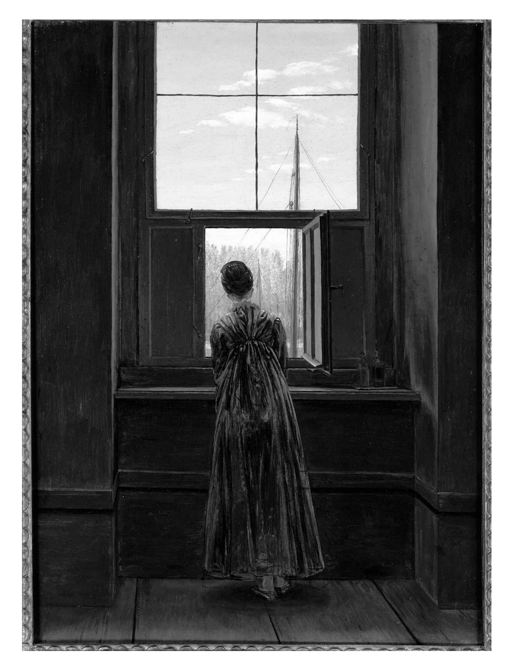
Figure 11.3 Caspar David Friedrich, Woman at the Window , 1822 (Nationalgalerie, Staatliche Museen, Berlin)

vision.<sup>15</sup> Fried also reads Friedrich's insistence on placing the act of looking at the center of his compositions as an "allegory of subjective orientation in Kant's sense" (AL 122):